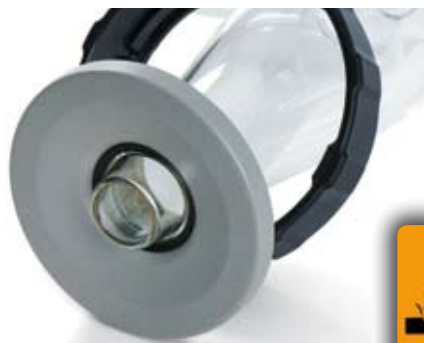
PFA coated metal (acid resistant)