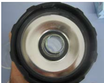
Not coated metal

NOTE: Do not spray hydrochloric acid (HCl) because it will corrode the stainless steel parts of the nozzle.