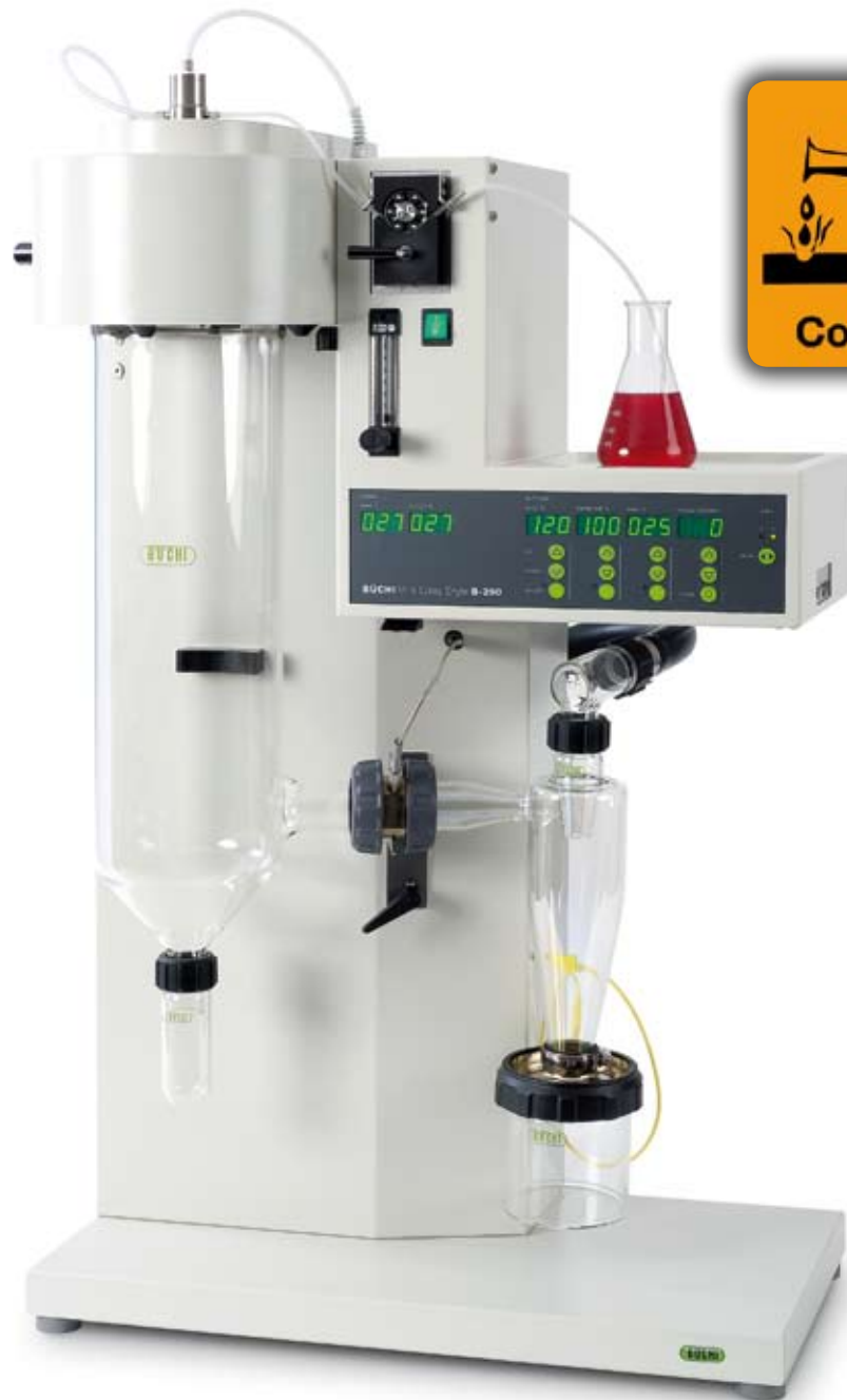
Mini Spray Dryer B-290 acid resistant